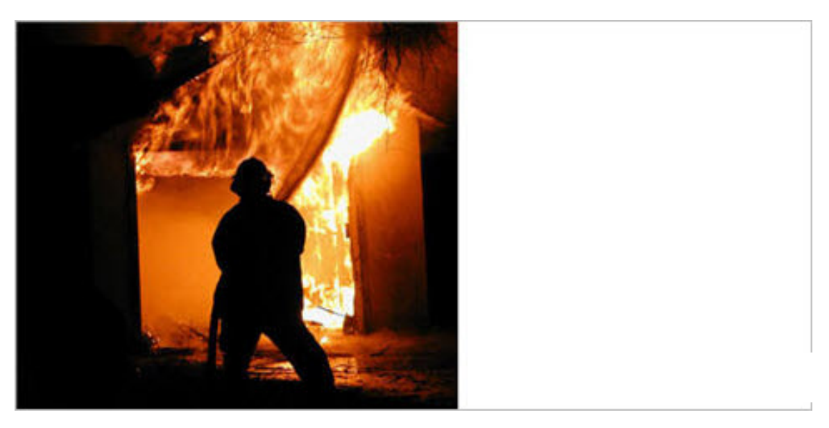
TRACCESS CI Custom Login Image